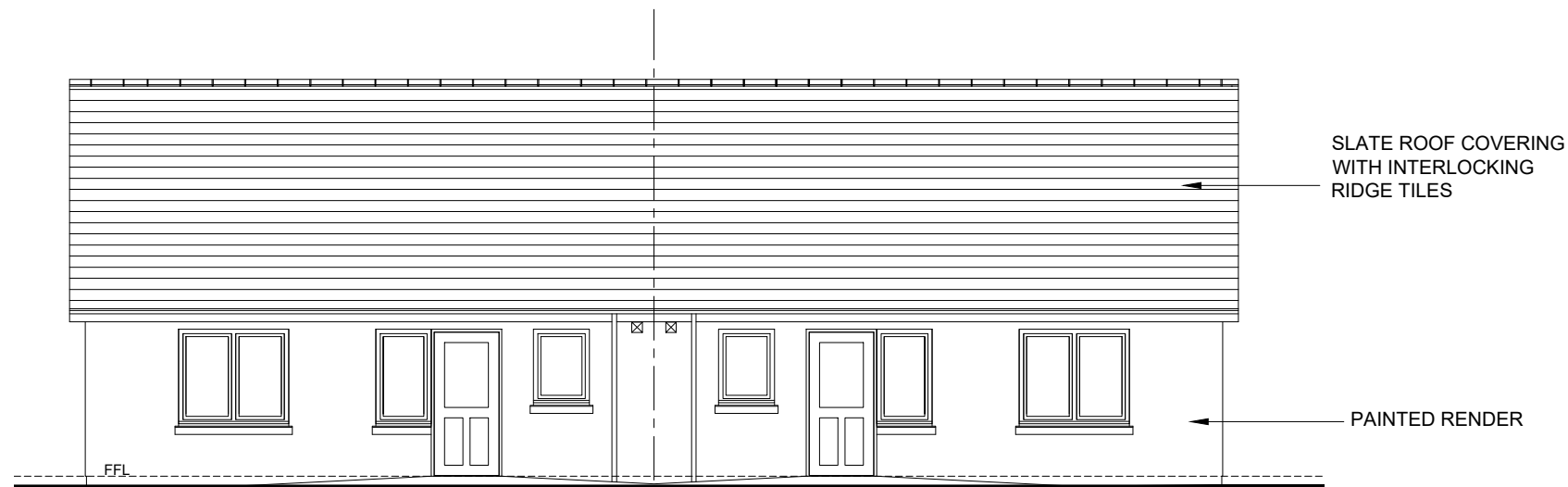
REAR ELEVATION 1:100 (UNITS)