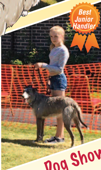
Best Junior Handler