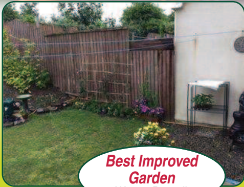
Best Improved Garden Wayne Purnell