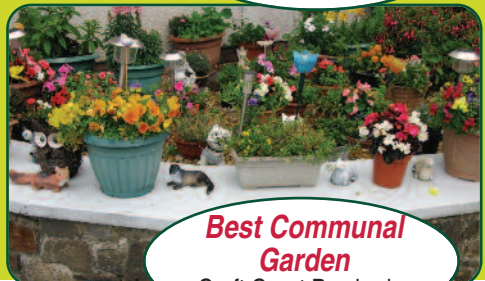
Best Communal Garden Croft Court Pembroke