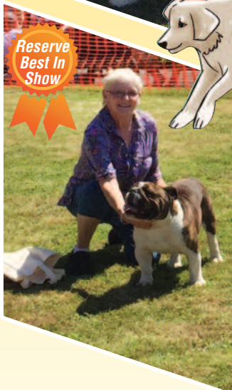
Reserve Best In Show