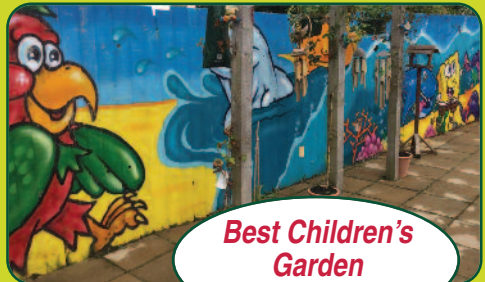
Best Children's Garden Shannon Folena