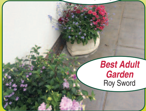
Best Adult Garden Roy Sword