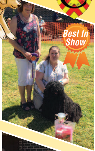
Best In Show